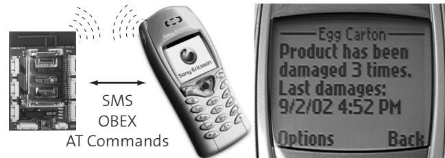
Figure 1: Product monitoring using BTnodes as smart tags and SMS via mobile phones.

Bluetooth is a connection-oriented, wireless communication medium that assures interoperability between different devices. A standardized interface (HCI) hides most of the lower-layer abstraction from the system developer and releases the host-system from digital signal processing and real-time system tasks. Networks of Bluetooth devices are organized in Piconets. These are Master-Slave star topologies that can be interconnected to form larger Scatternets. Compared to other media used in low-power wireless research [6, 3], Bluetooth offers considerably higher bandwidth, abstract and high-level link-layer functionality such as synchronous communication, multiplexing, integrated audio, different channel characteristics, link keys and encryption. The most apparent difference is that the developer is not dealing with a baseband and MAC interface but with dedicated communication channels.