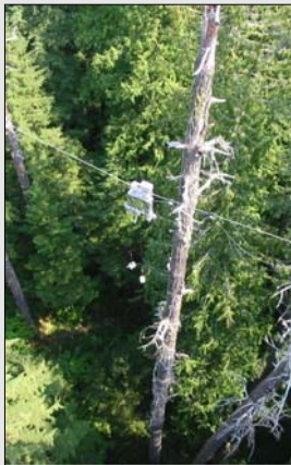
Horizontal and Vertical Transport